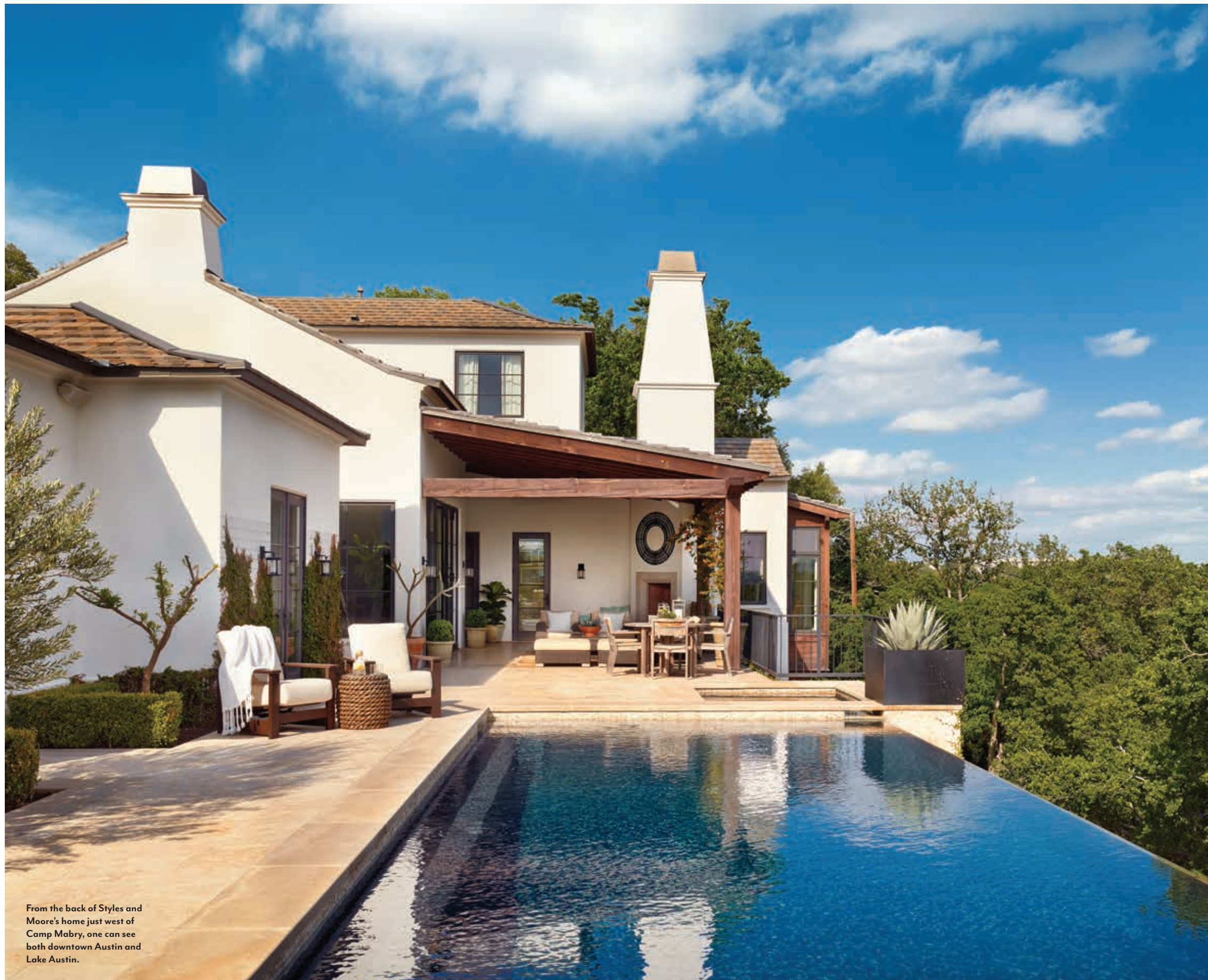
From the back of Styles and Moore's home just west of Camp Mabry, one can see both downtown Austin and Lake Austin.